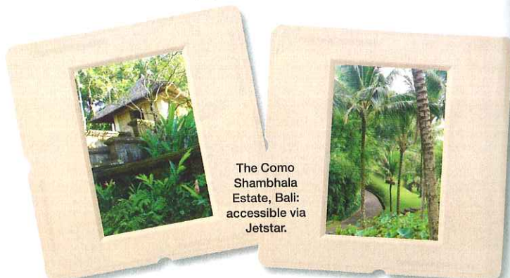
The Como Shambhala Estate, Bali: accessible via Jetstar.

The small but perfectly formed collection is the ideal inclusion in your carry-on.