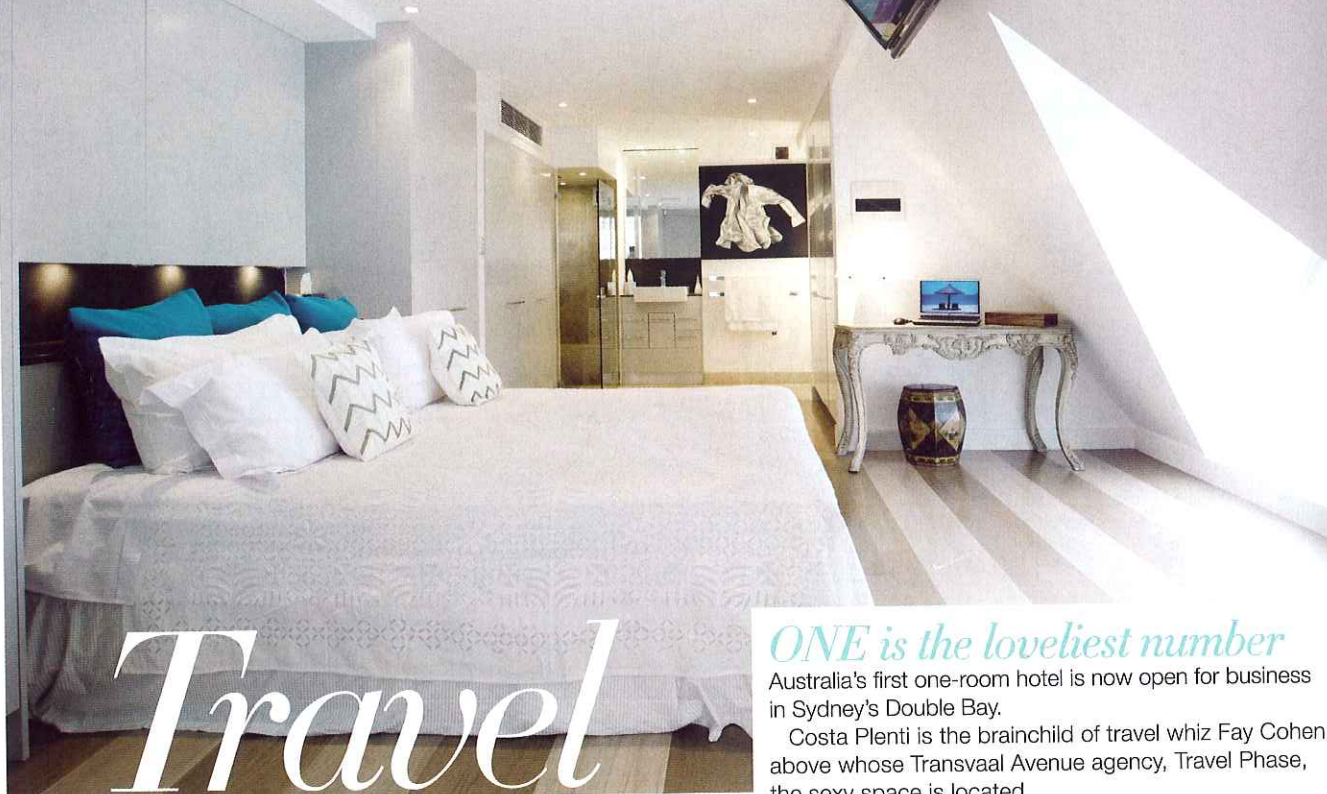
Alone time: Costa Plenti, Australia's first one-room hotel.